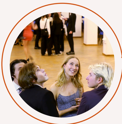
MASARYK DORMITORY OF CTUP

The official social event of GOMUN is the Sunday GOMUN Ball. The delegates may enjoy music, dancing battles or funny competitions between each other in an opulent hall in the Masaryk Dormitory.