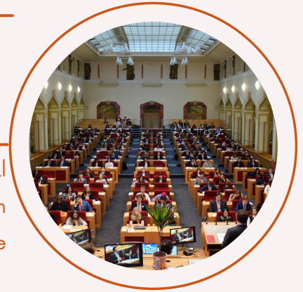
PRAGUE CITY HALL

During the Opening Ceremony the delegates are welcomed by several speeches usually delivered by the organisers and guest speakers. An introductory debate also takes place to warm the delegates up before the committee work starts.